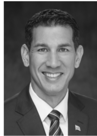
KAIALI'I KAHELE 1st Senatorial District