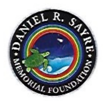
Helping Those Who Help All Of Us