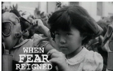
When Fear Reigned