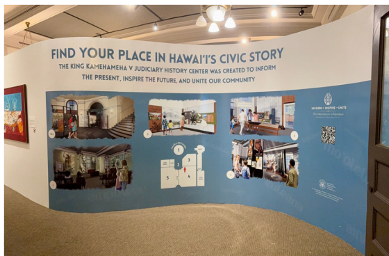
Exhibit Planning Mural