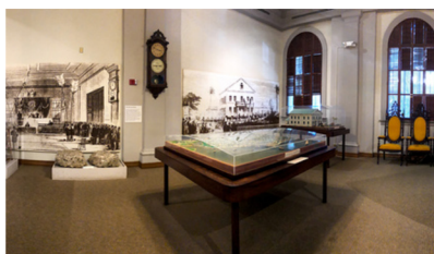
Monarchy Court Gallery