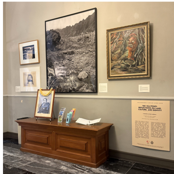
'Imi i Ka Pono: Reflections on Law, Culture, and Identity