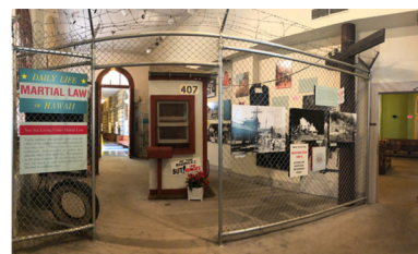
Hawaii Under Martial Law