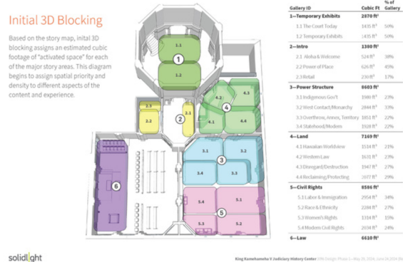
New Museum Floorplan Mockup