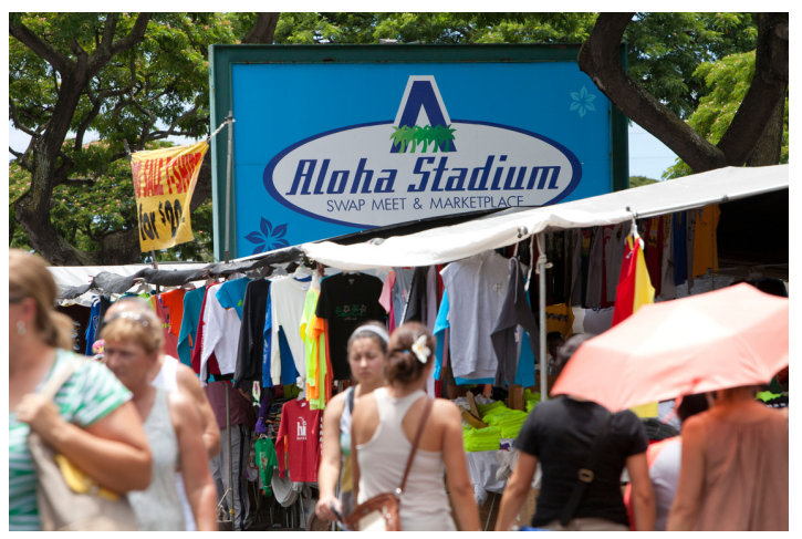
Swap Meet & Marketplace