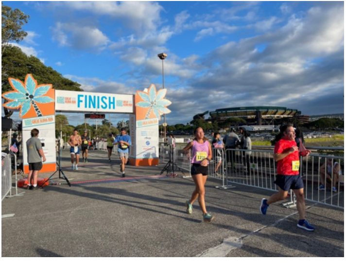
Great Aloha Run