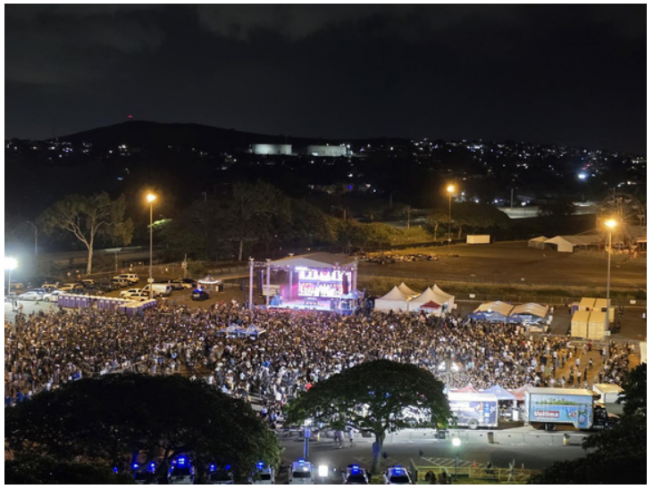
Concerts (Upper Halawa Lot)