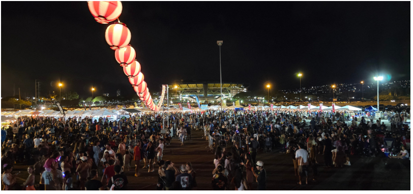
Megabon (Lower Halawa Lot)