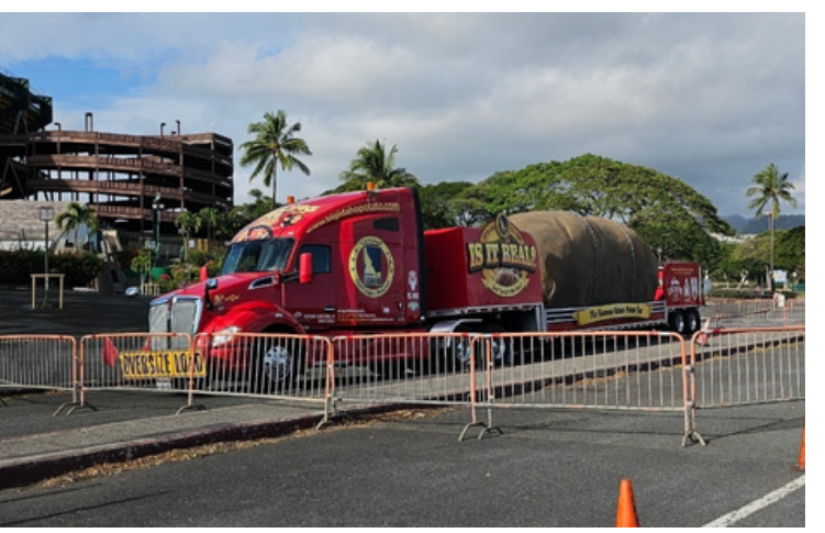
Hawaii Foodbank Drive Event