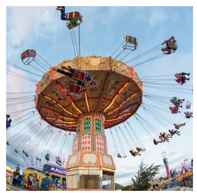
50th State Fair