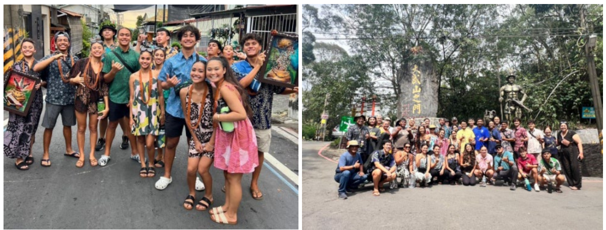
16 students from Kamehameha Schools visited Taiwan from July 14 to 26

• July 17: Sixteen students from Kamehameha Schools, aged 16 to 18, along with 14 cultural practitioners—including teachers, a navigator, a kumu hula, a traditional ceremony specialist, and weavers—visited Taiwan from July 14 to July 26. We would like to thank the Hualien County Government for extending the invitation. During their stay, they participated in the Indigenous Harvest Ceremony and visited various cultural villages. Their itinerary also included a trip to Taitung County, with the journey concluding in Taipei.