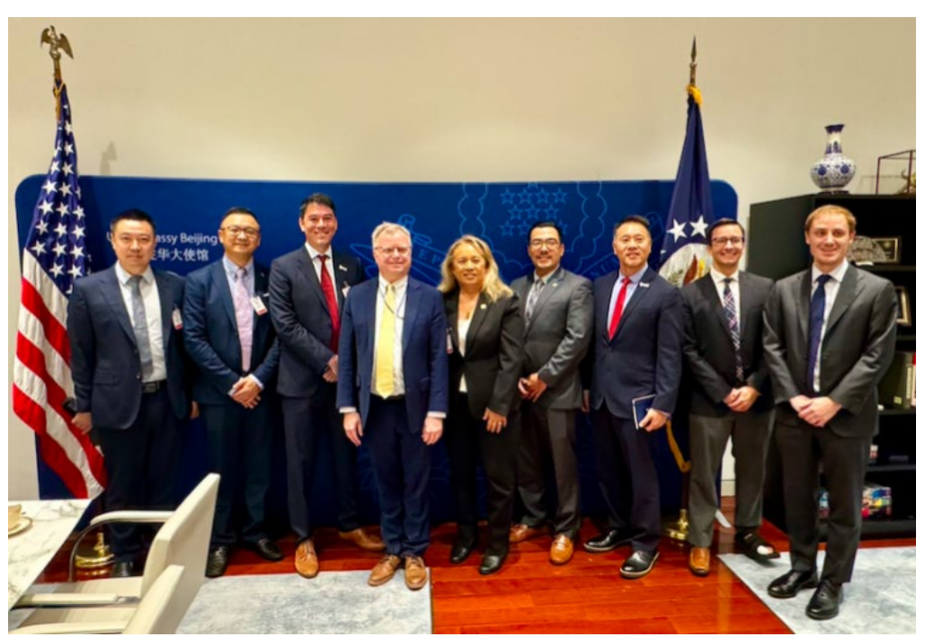
China Travel Mission, in partnership with HTC, at the ITB Shanghai