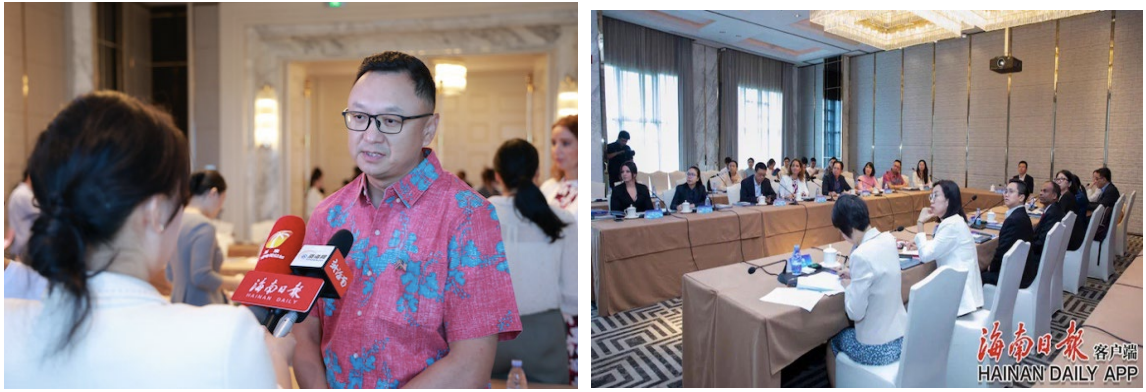
SHOB attended the 2024 Hainan Liaison Meeting hosted by Hainan FAO

• November 22: SHOB held an online meeting with the Guangdong Foreign Affairs Office (GDFAO) to discuss plans for the 40<sup>th</sup> Anniversary of the Hawai'i-Guangdong Sister State/Province Relationship in 2025. The discussion also centered on strategies to enhance collaboration and further strengthen exchanges and cooperation between the two regions.