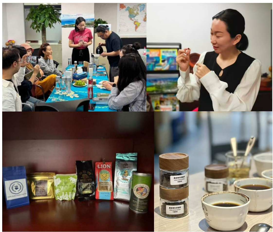
SHOB attended different coffee events to strengthen its market presence for Hawai'i coffee