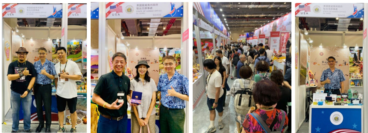
SHOT attended the 2024 Food Taipei exhibition at the Taipei World Trade Center Exhibition Hall

• From June 26 to June 29, the 2024 Food Taipei exhibition took place at the Taipei World Trade Center Exhibition Hall. As part of this renowned international food and beverage expo, the Taiwan Ministry of Foreign Affairs (MOFA) generously sponsored a booth for Hawai'i, providing a platform to showcase and promote authentic Hawai'i made products. This booth featured a diverse range of high-quality Hawaiian goods, including specialty foods, coffee, and unique local products, highlighting the islands' rich agricultural industry. This event presented a valuable opportunity to strengthen trade connections and introduce Hawai'i's unique offerings to a Taiwanese audience.