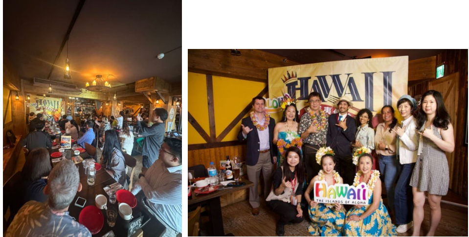
ABV American Bistro & Bar, located in Taipei, officially launched the Hawai'i Food Festiva

• November 15: ABV American Bistro & Bar, located in Taipei, officially launched the Hawai'i Food Festival, featuring 10 exquisite Hawaiian dishes. Running from that day through February 2025, the event not only offered authentic Hawaiian cuisine but also included Hawaiian coffee and craft beer. In addition to enjoying delicious food and drinks, guests could participate in a lucky draw (a free tour to Hawai'i) sponsored by Dragon Hawai'i Tours.