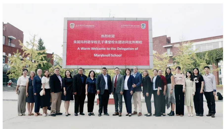
A group of 13 students and teachers from BFSU Foreign Language School visited Maryknoll School