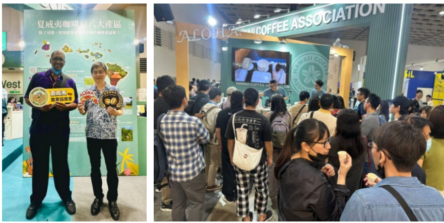
HCA was represented by seven coffee experts who traveled to Taiwan to participate in the 2024 Taiwan International Coffee Show

• The 2024 Taiwan International Coffee Show was held at the Nangang Exhibition Center from November 15 to November 18. The HCA was represented by seven coffee experts who traveled to Taiwan to participate in the trade show. During the four-day exhibition, many visitors stopped by the Hawai'i booth and praised Hawaiian coffee. At the farewell banquet, coffee experts who had visited Hawai'i for a reverse trade mission in 2022 were invited to join the gathering, creating a warm and joyful atmosphere while strengthening relationships between coffee farmers and buyers.