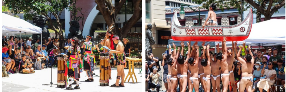
Taiwan sent one of its largest delegations ever, comprising nearly 350 people to the 13th FestPAC, 2024