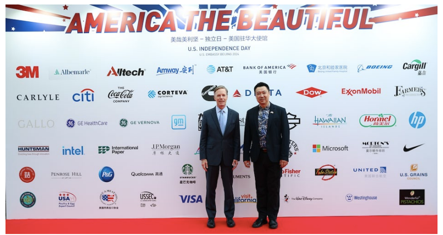
SHOB attended the Independence Day Sponsor Appreciation Reception at the U.S. Ambassador's Residence

• August 26: SHOB attended the Independence Day Sponsor Appreciation Reception at the U.S. Ambassador's Residence. During the event, SHOB highlighted the visa challenges faced by MICE (Meetings, Incentives, Conferences, and Exhibitions) groups. As a tourism-focused destination, Hawai'i welcomed a significant number of visitors and incentive travel groups annually, but visa-related obstacles remained a considerable concern in China. SHOB emphasized the importance of streamlining group visa processes to enhance convenience and support Hawai'i's tourism industry.