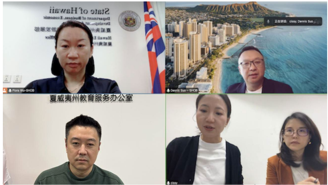
SHOB held an online meeting with the Guangdong Foreign Affairs Office (GDFAO)

• November 22: SHOB held an online meeting with the Guangdong Foreign Affairs Office (GDFAO) to discuss plans for the 40<sup>th</sup> Anniversary of the Hawai'i-Guangdong Sister State/Province Relationship in 2025. The discussion also centered on strategies to enhance collaboration and further strengthen exchanges and cooperation between the two regions.