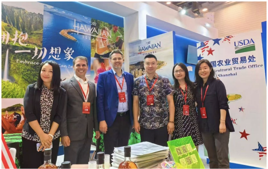
SHOB and HTC were invited by Brand USA and the Jiangsu Provincial Department of Culture and Tourism to participate in the 6<sup>th</sup> Annual Grand Canal Cultural Tourism Expo in Suzhou

The online segment of the Expo included over 3,000 exhibitors and 730 buyers, offering online consultations and communication. The total number of buyer-seller consultation appointments exceeded 64,000, with a 44% success rate in matching. The online Expo page was visited more than 247 million times.