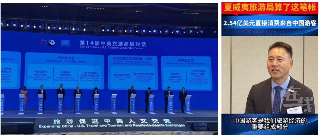
SHOB and HTC facilitated HTA's participation in the 14<sup>th</sup> U.S.–China Tourism Leadership Summit

A key achievement of the conference was HTA's signing of a strategic partnership with Spring Airlines. This collaboration aims to attract Spring Airlines' customers to Hawai'i by leveraging the airline's position as China's largest budget carrier, as well as its codeshare partnership with Japan Airlines for Hawai'i routes. There is significant potential to expand these codeshare connections, linking multiple cities in China to Hawai'i via Japan.