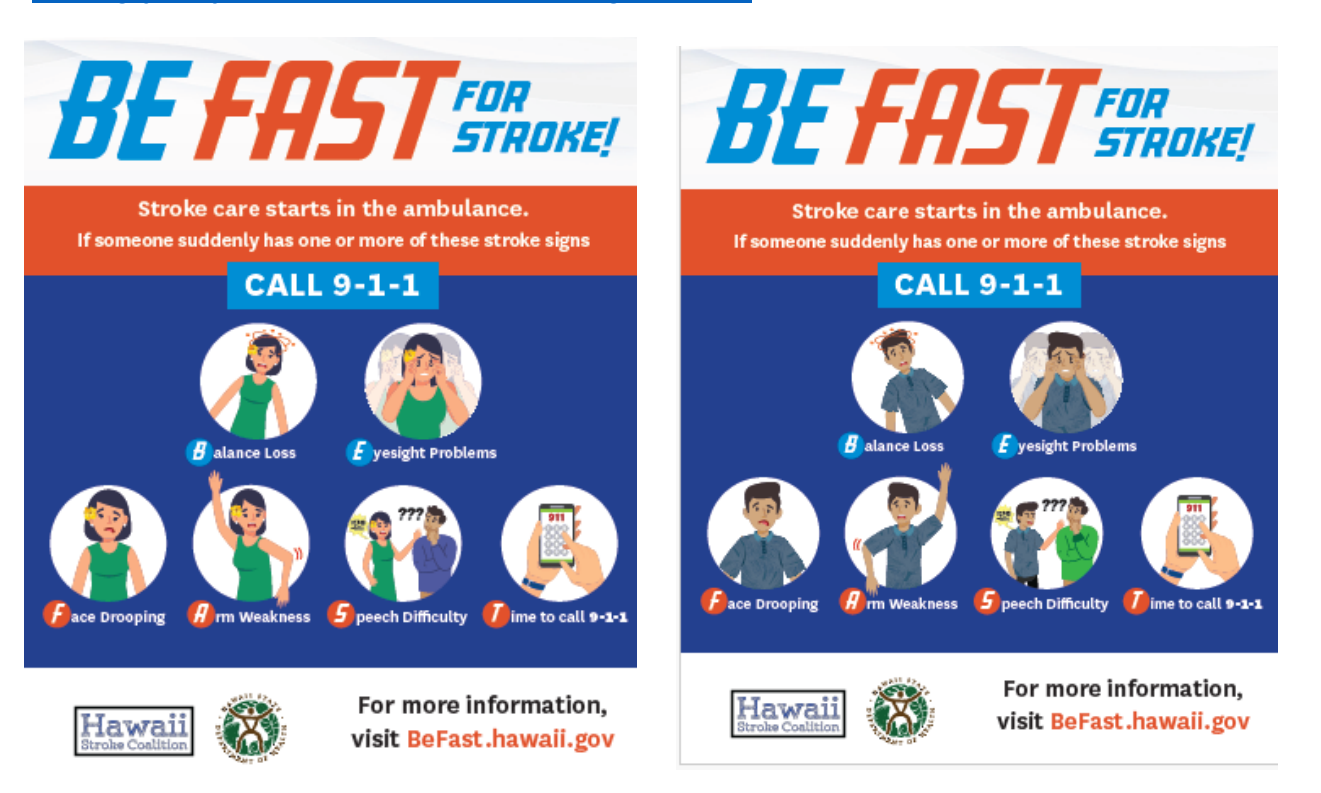
Table 5. HSC Stroke Campaign 2024

https://www.dropbox.com/scl/fo/w7a80uv8oeorlqipd00sd/ADPCkOr8DhYd4b2OvsHx45l?rlkey=n73hgkjlc3fojsz22qm9556on&e=1&st=fuxugbsz&dl=0