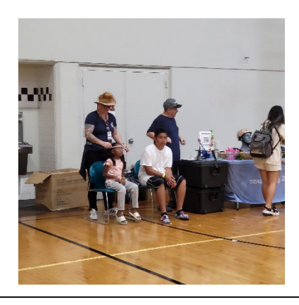
Families learning proper fit & care of a helmet, protecting their brain, & street safety at Healthy Kids Day.