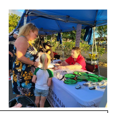
Partnering with Brain Injury Association of Hawaii and Pacific Disabilities Center to bring military families resources on recognizing and living with brain injury.