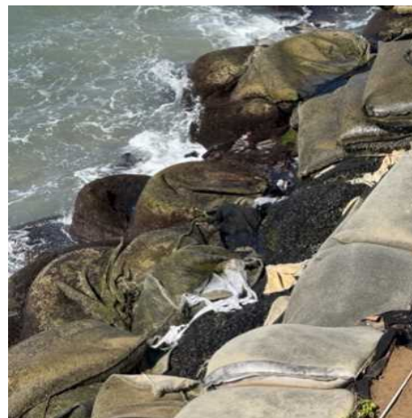
Sand bag deterioration (2025)