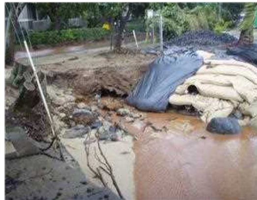
Drainage Easement Area (2007)