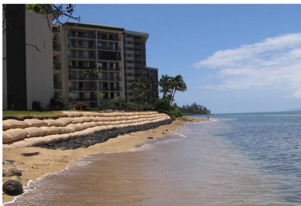
Completed sand bag revetment (2007)

Rock rubblemound revetment design follows well known engineering guidelines, with the rock being sized to design parameters calculated by engineers. It is a long-term structure. Sand bags come in limited sizes, and even the most robust sand bag installations eventually degrade due to bag movement and undermining by waves, fabric degradation, and vandalism. Sand bags are slippery when covered with limu, and can become a clear public safety hazard.