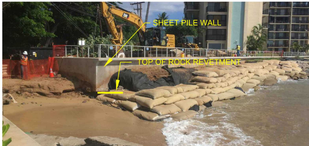
Existing sheet pile wall, built in 2018. Rock revetment crest is below the concrete pile cap, as shown, and will replace all of the sand bags.