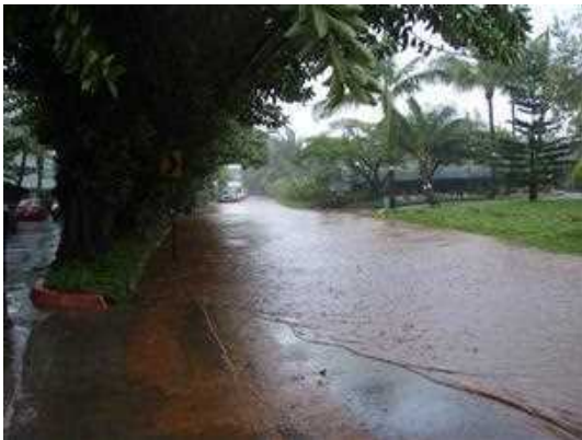
Flooding of Lower Honoapiilani Road (2007)

Lower Honoapiilani Road is extremely close to the shoreline at the easement area and is at risk. The roadway also contains power lines, telecommunication cables, the storm drains system and the sewer lines. All of these are presently at risk and will be protected by installation of the revetment.