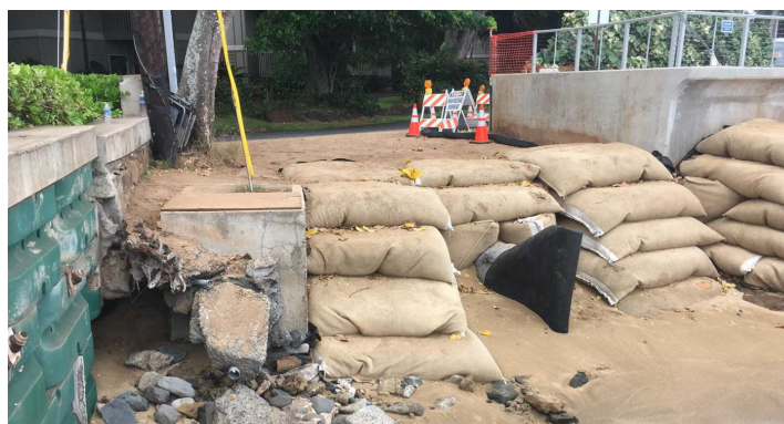
Drainage Easement with temporary protection installed by the Hololani (2020)