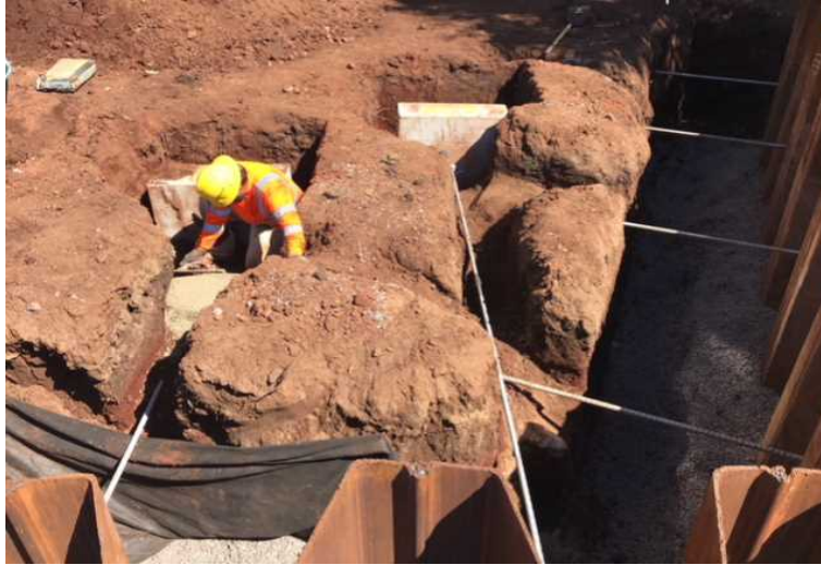
Installation of sheet pile anchors

Yes. DLNR-OCCL does not permit even temporary protection until the shoreline erosion scarp is within 20 ft of a habitable structure. All walls and revetments typically require at least that amount of horizontal space for construction. Despite the vertical appearance, the sheet pile at Hololani is supported by anchors that are tied back 15 feet from the face of the wall.