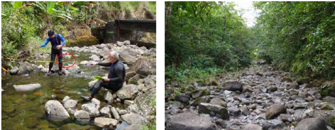
Figure 15. Changes in instream habitat after stream diversion on Honomanū Stream, Maui. The diversion, downstream of the surveyors, was diverting 100% of stream flow (left picture). Downstream of diversion (right picture) there is no water flow and no habitat for aquatic animals.

The diversion of all of a stream's base flow has obvious significant impacts. But BLNR continued to renew these permits for decades. For years, BLNR renewed these permits in secret – failing to properly notify the public about its decisionmaking. It was only after Nā Moku sued that A&B began working on an environmental impact statement, which was not completed until September 2021. That EIS revealed that the diversions caused the loss of 88.2% of the habitat of some streams. Here are some photographs that depict the damage caused by these permits from a report produced by the Bishop Museum and BLNR's Division of Aquatic Resources in 2009: