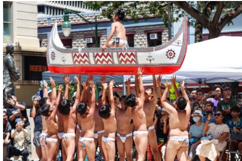
Taiwan sent one of its largest delegations ever, comprising nearly 350 people to the 13 th FestPAC, 2024