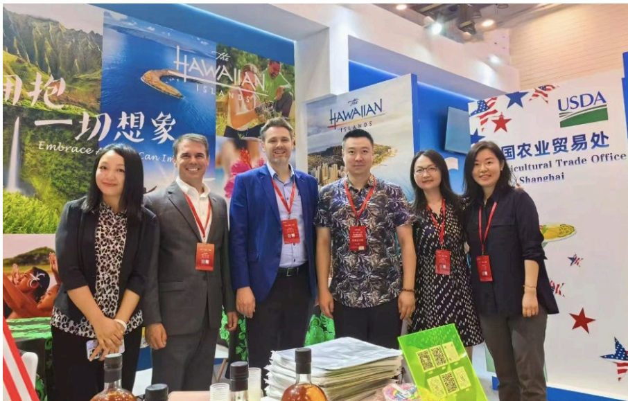
SHOB and HTC were invited by Brand USA and the Jiangsu Provincial Department of Culture and Tourism to participate in the 6 th Annual Grand Canal Cultural Tourism Expo in Suzhou

The online segment of the Expo included over 3,000 exhibitors and 730 buyers, offering online consultations and communication. The total number of buyer-seller consultation appointments exceeded 64,000, with a 44% success rate in matching. The online Expo page was visited more than 247 million times.