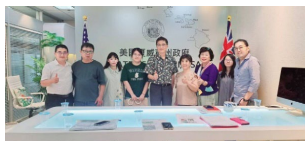
Professor, students, and parents from Chung Hua University visited the SHOT office