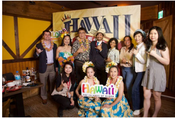
ABV American Bistro & Bar, located in Taipei, officially launched the Hawai'i Food Festival