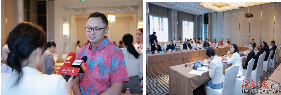
SHOB attended the 2024 Hainan Liaison Meeting hosted by Hainan FAO