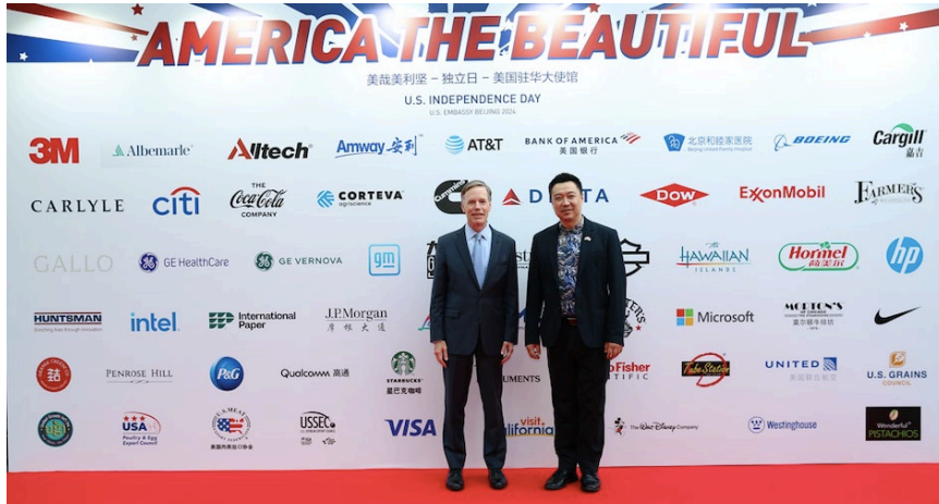
SHOB attended the Independence Day Sponsor Appreciation Reception at the U.S. Ambassador's Residence