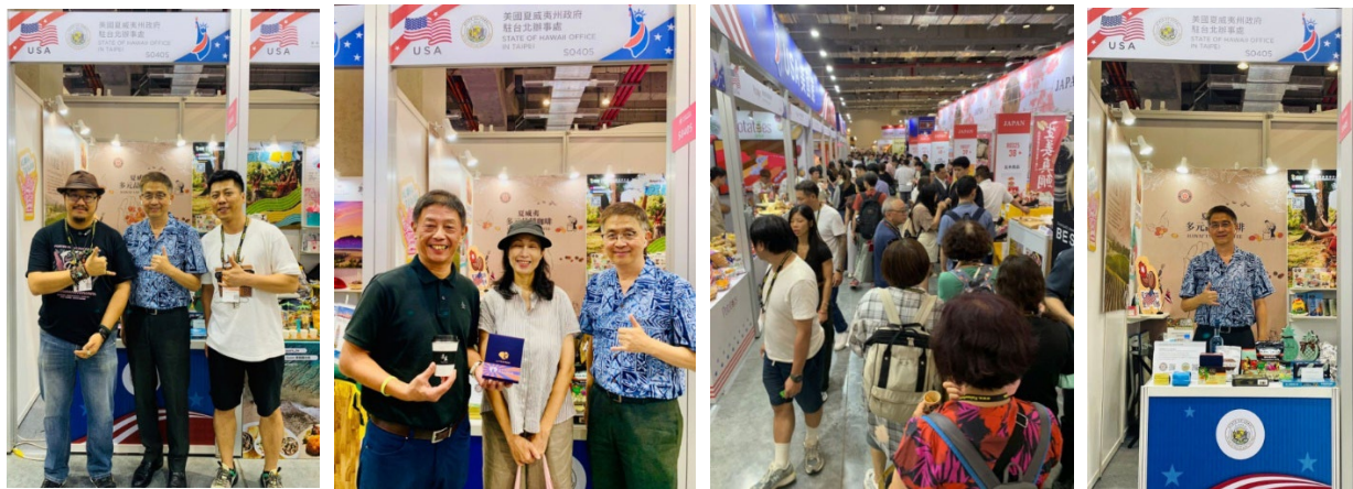
SHOT attended the 2024 Food Taipei exhibition at the Taipei World Trade Center Exhibition Hall