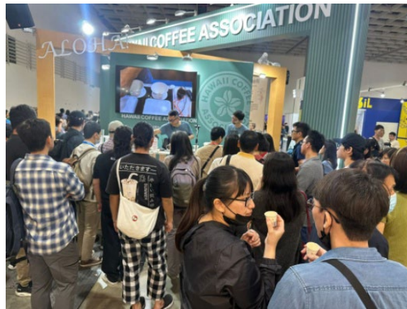
HCA was represented by seven coffee experts who traveled to Taiwan to participate in the 2024 Taiwan International Coffee Show