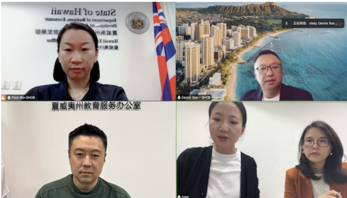
SHOB held an online meeting with the Guangdong Foreign Affairs Office (G DFAO)