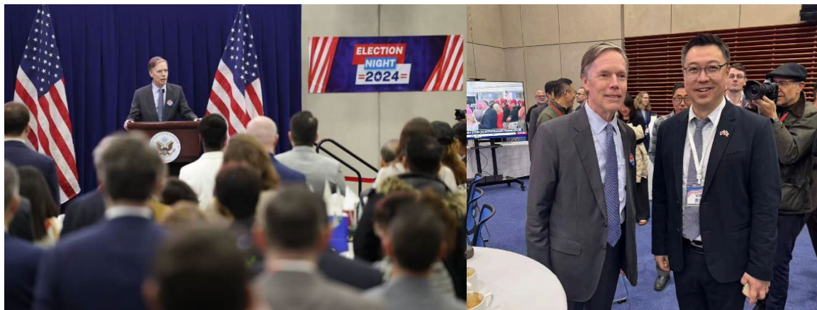
Invited by Mr. Nicholas Burns, U.S. Ambassador to the PRC, SHOB attended the 2024 Election Day event in Beijing