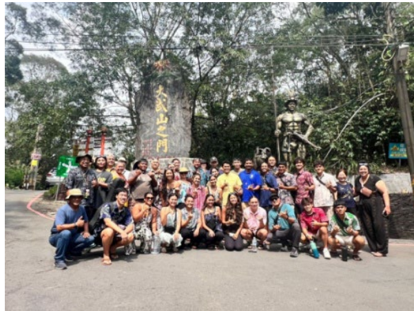
16 students from Kamehameha Schools visited Taiwan from July 14 to 26