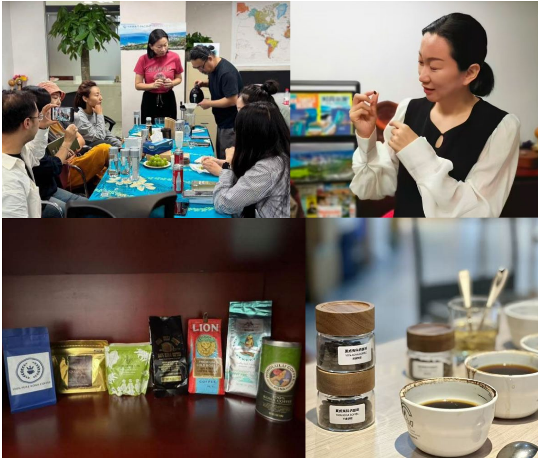
SHOB attended different coffee events to strengthen its market presence for Hawai'i coffee