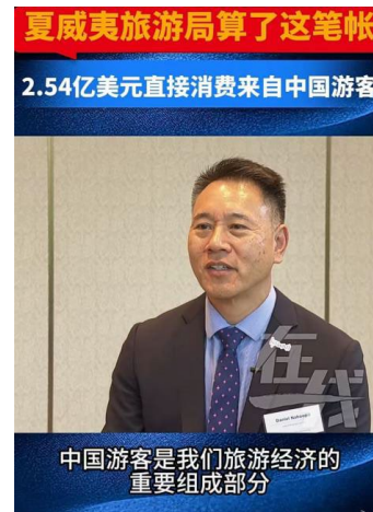
SHOB and HTC facilitated HTA's participation in the 14 th U.S.–China Tourism Leadership Summit