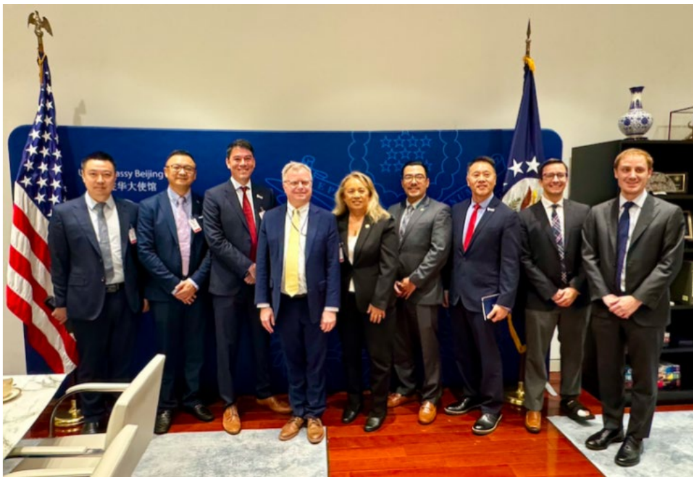
China Travel Mission, in partnership with HTC, at the ITB Shanghai