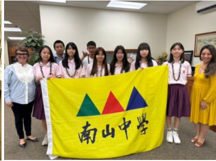
Nanshan High School visited Hawai'i on July 17, 2024