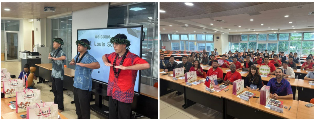
Saint Louis School visited Taiwan from November 1 to November 10, 2024