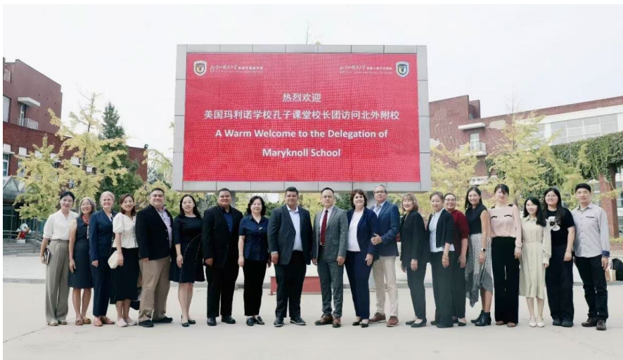
A group of 13 students and teachers from BFSU Foreign Language School visited Maryknoll School