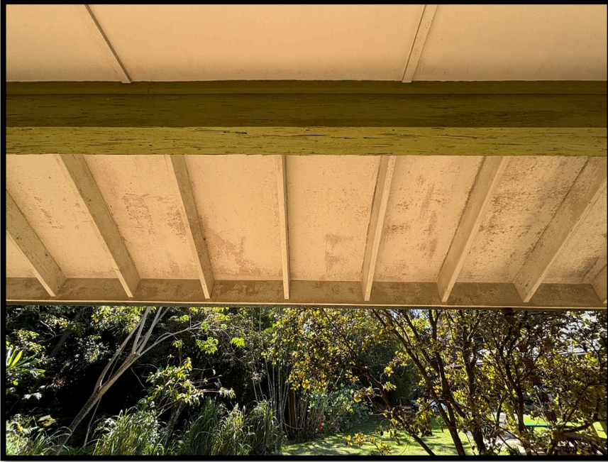
Lower Left & Right: Examples of mildew on education facility