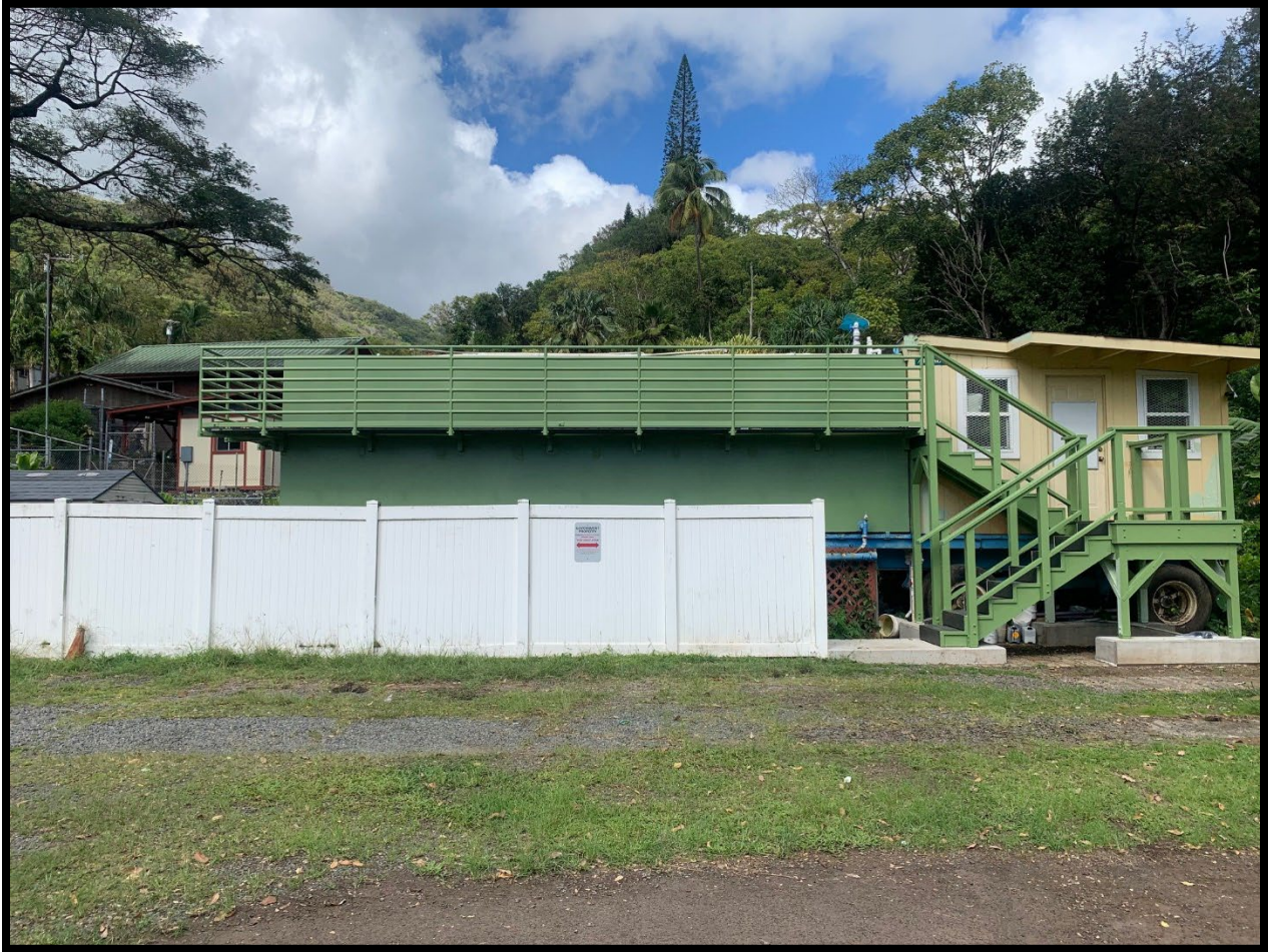
Above: HNC's above ground Individual Wastewater System, Green Machine.