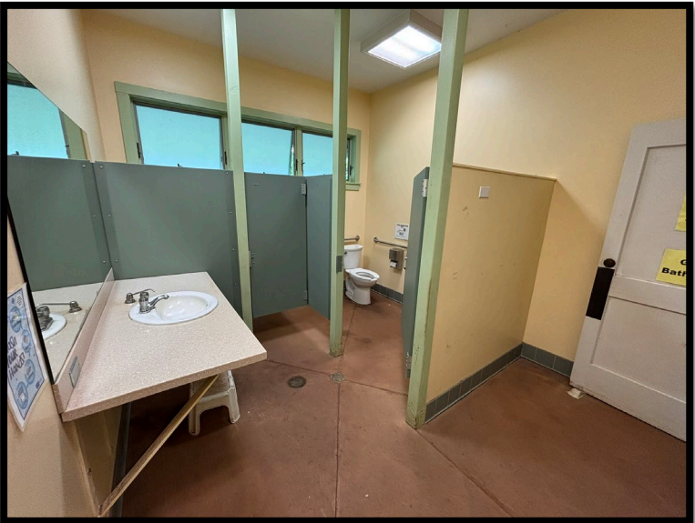
Above: HNC Bathrooms that need upgrading, more stalls and wash basins Bellow Left: Classroom, carpet to be replaced Bellow Right: Degraded HNC kitchen appliances.