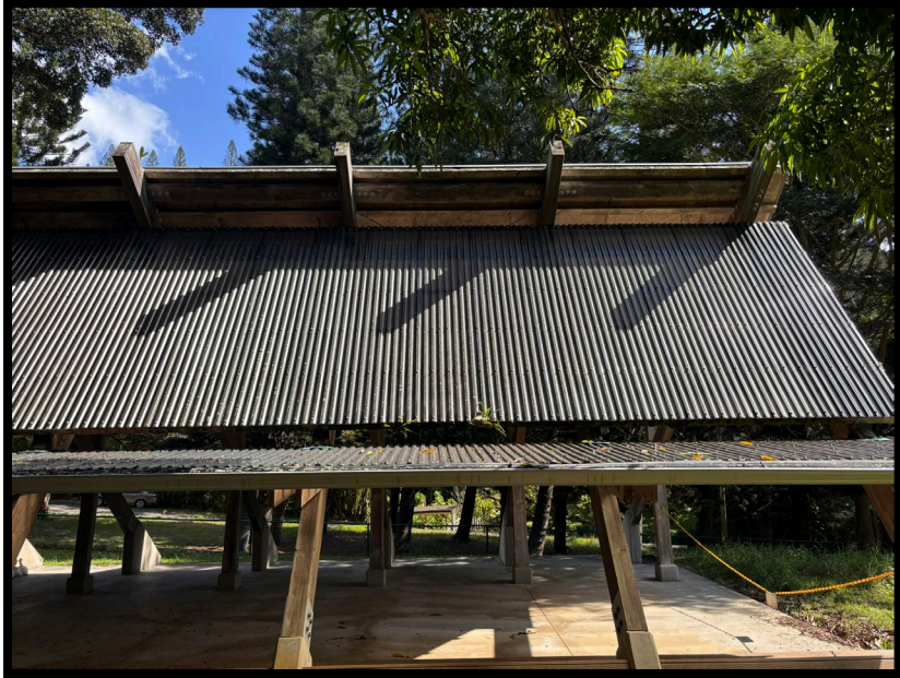
Upper Left: HNC's Hale Malu