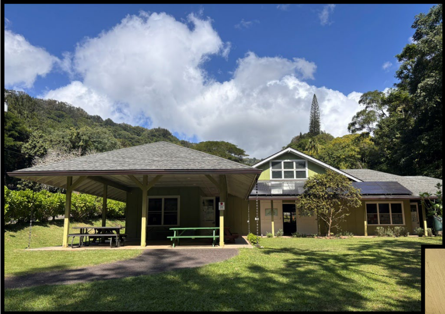
Left: HNC Makiki Field Site