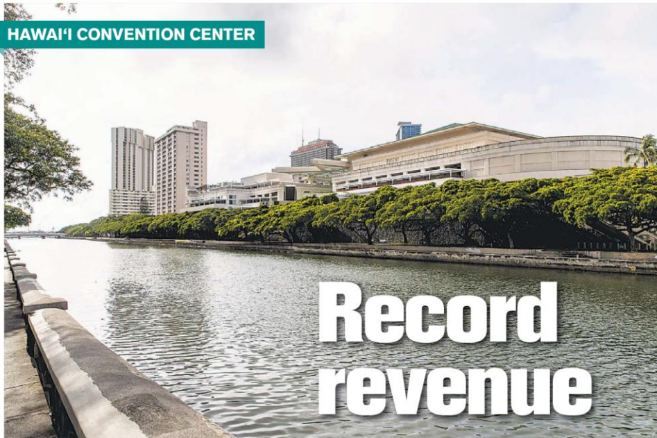
Honolulu Star Advertiser, Jan 8, 2024