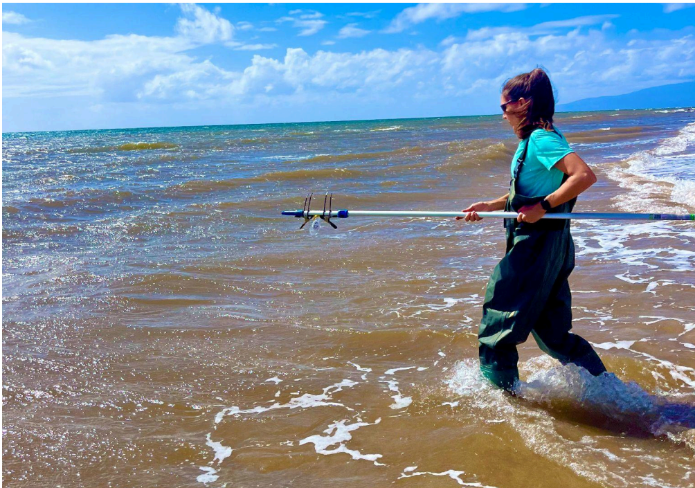
Image 1. Example of Surfrider staff collecting enterococcus bacteria samples during a Brown Water Advisory on January 10, 2024 off of West Maui using protective waders and an extension pole.