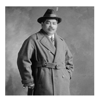
The Citizen Prince March 26, 1871 – January 7, 1922

Excerpt from State DHHL Website: "The Hawaiian Homes Commission Act intended to return native Hawaiians to the land, while encouraging them to become self-sufficient homesteaders on leased parcels of land."