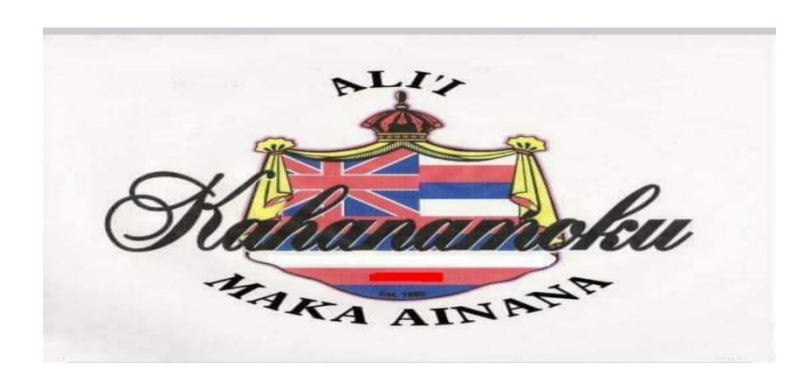
April 8, 2024