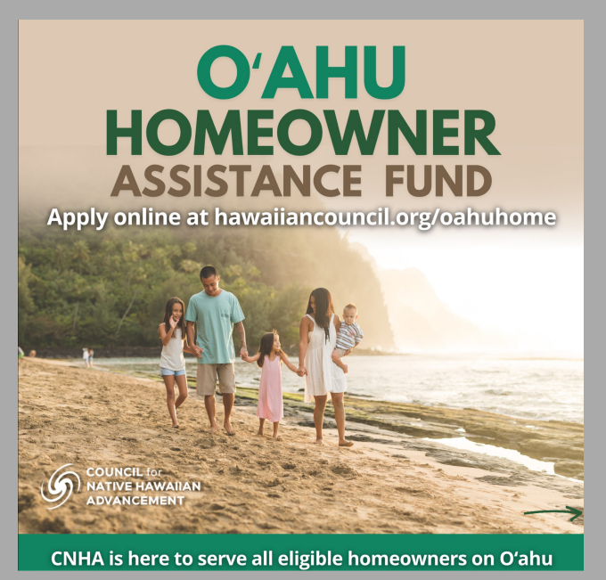
O'ahu Homeowner Assistance Fund flyer

e. Veterans and families that include a veteran family member that meet one of the preceding criteria.