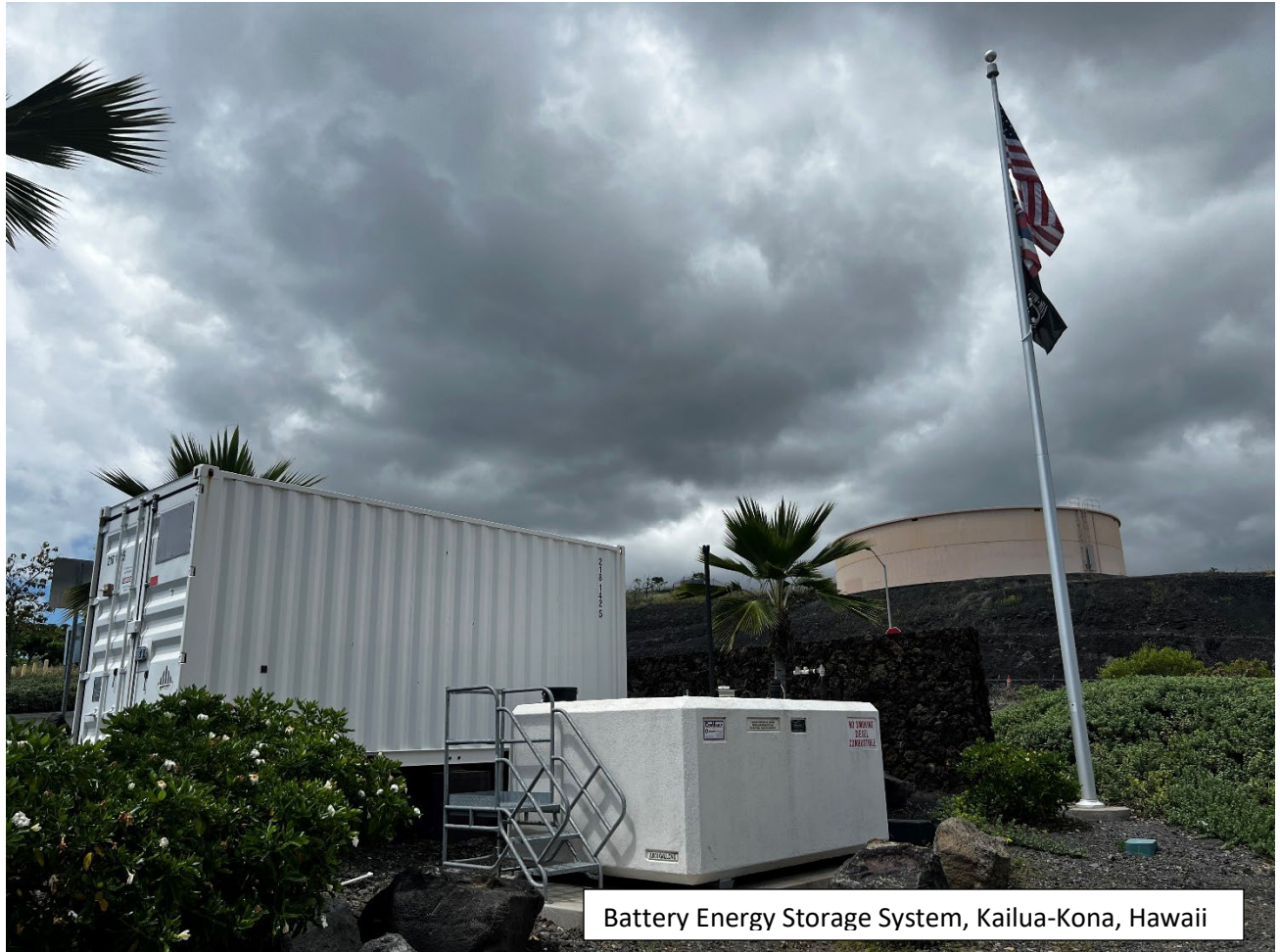
Battery Energy Storage System, Kailua-Kona, Hawaii