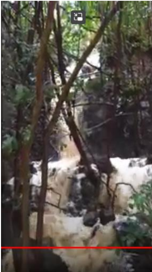
Discharge from Big Island Dairy to the streams surrounding O`okala.