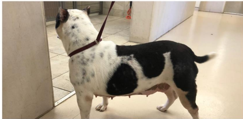
Exxy before and after surgery for an abdominal hernia, suspected to be secondary to a backyard C-section. She also has very short, cropped ears, which are prone to infection and usually an indication of amateur surgery.