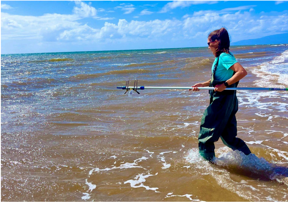
Image 1. Example of Surfrider staff collecting enterococcus bacteria samples during a Brown Water Advisory on January 10, 2024 off of West Maui using protective waders and an extension pole.