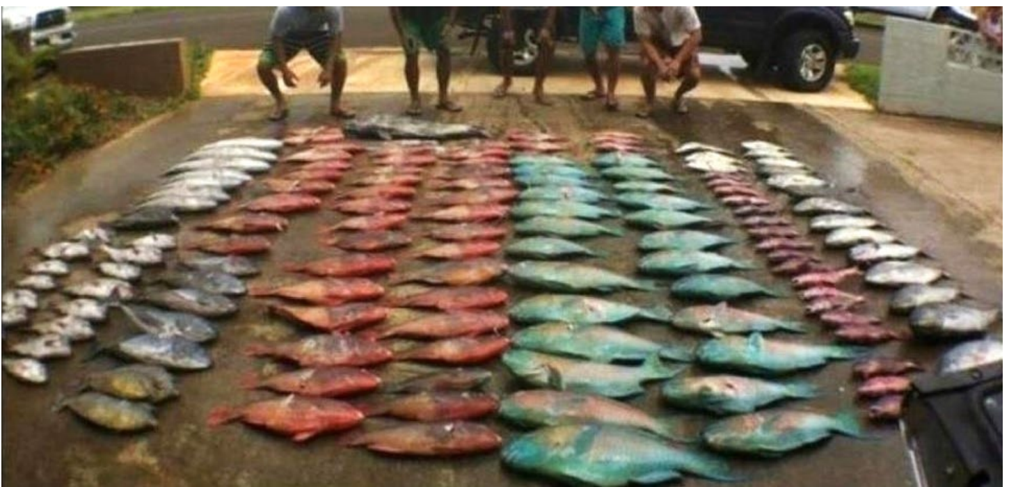
Fig.3. Example of overexploitation of sleeping parrotfish (large red and blue fish) from a single night spearfishing.