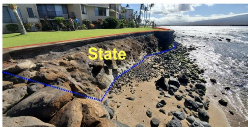
*SHORELINE FOLLOWS SOLID RED LINE **ENCROACHMENT FOLLOWS DASHED BLUE LINE

The seawall repairs totaled $3 million dollars, financed solely by Milowai Maalaea owners. The area continues to be accessed routinely by snorkelers, surfer, fisherman and spear fisherman.