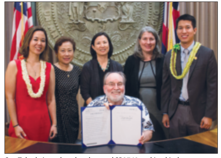
Sen Tokuda introduced and passed SB2768 making kindergarten mandatory for all 5 year olds as a part of the foundation for Hawaii's publically funded early learning system.

Introduced by Sen Tokuda in an effort to revitalize the Council, the bill amends its leadership as was requested by community advocates and requires the Council to hold quarterly meetings on the status of the Kaneohe Bay Master Plan. A report on any updates and needed statutory changes to maximize the relevance and operation of the Council is due to the Legislature prior to the next session.