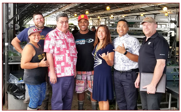
The state awarded MA'O Organic Farms with a second Legacy Lands Grant of $650,000 to support the purchase of the "Purple Spot" lands in Lualualei Valley. The Legislature also appropriated $150,000 to support MA'O's Youth Leadership Training program. Senate President Kouchi, Sen. Shimabukuro, and Rep. Gates visited MA'O.