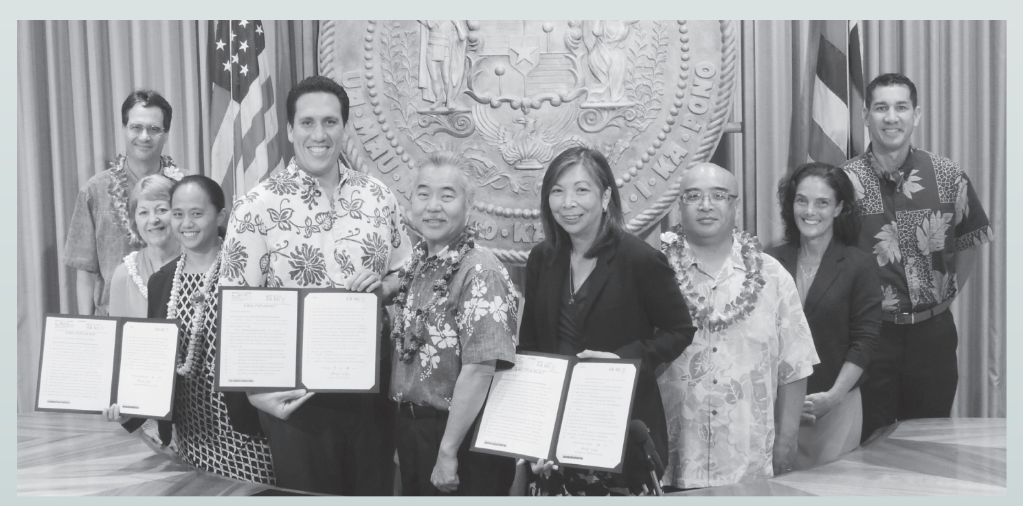
June 25,2019: Attending the bill signing of HB168, HB1248 and SB216 -- all measures relating to voting and elections.

Requires a mandatory recount of election votes when the difference between two candidates is equal to or less than 100 or one-quarter of 1% of the total number of votes cast, whichever is greater.