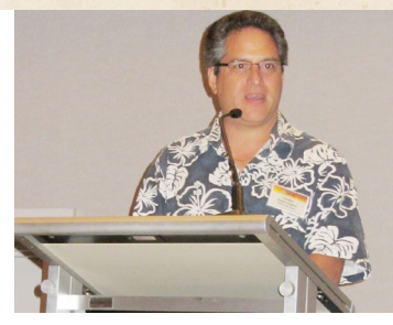
Above: Sen. English addresses attendees of the Asia- Pacific Disaster Risk Reduction Workshop. Below - Sen. English meets with representatives of the Office of the U.S. Secretary of Defense and the Pacific Disaster Center. August 15, 2012.

The inaugural Asia-Pacific Disaster Risk Reduction and Resilience, (APDR3) Asia-Pacific Resilience and Sustainability Workshop was held on Oahu on August 14th-16th, 2012. Senator English was invited to participate to help define a program and timeline for promoting resilience across the Asia-Pacific region, involving private industry, government and civil society.