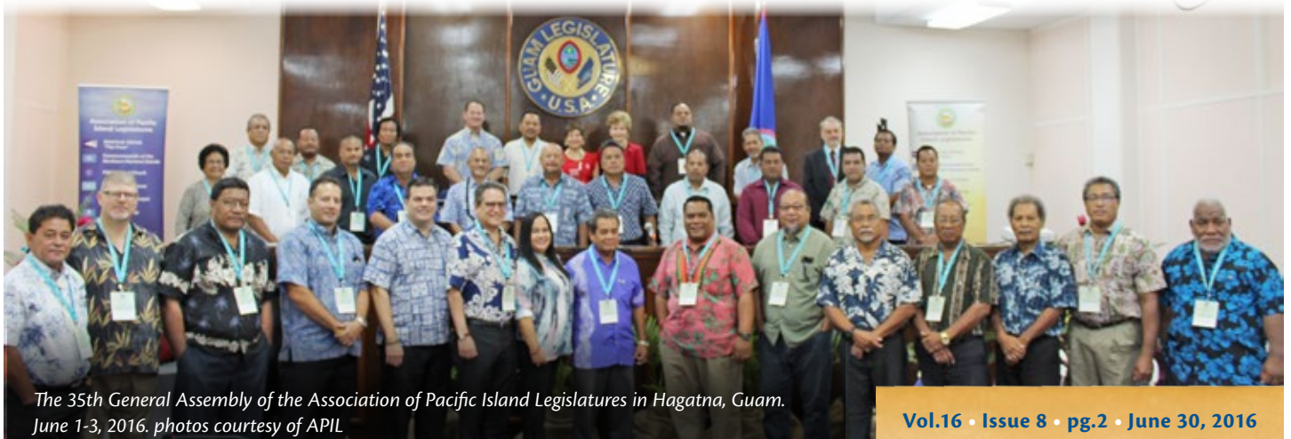
The 35th General Assembly of the Association of Pacific Island Legislatures in Hagatna, Guam. June 1-3, 2016.