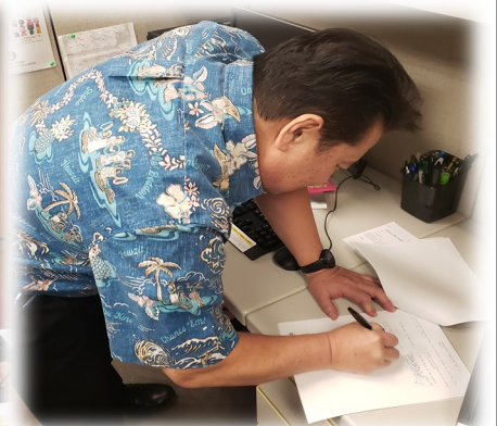
Review and Signing of SB 514 Providing a Tax Credit and Refund