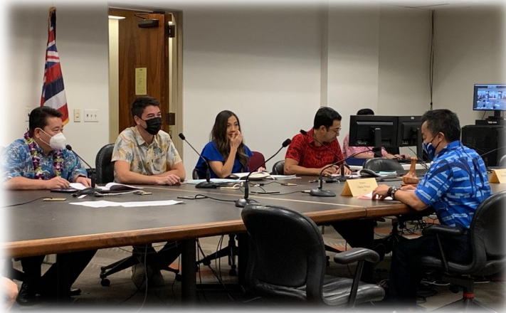
Negotiating SB 3334