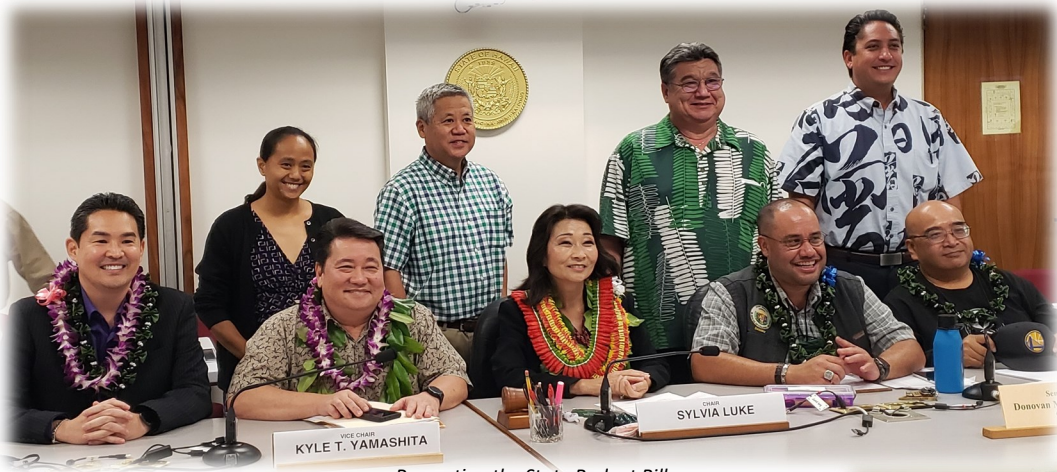
Presenting the State Budget Bill