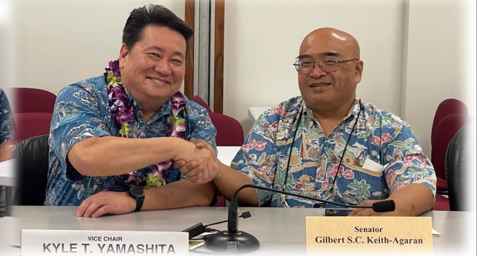
Finalizing the Statewide CIP Budget with Sen. Keith-Agaran