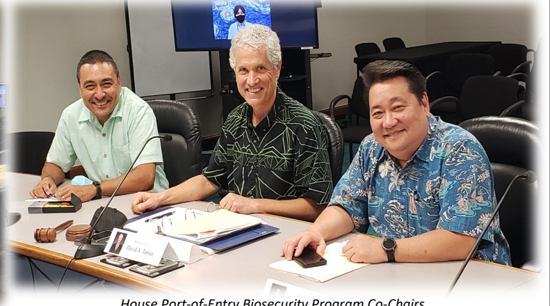
House Port-of-Entry Biosecurity Program Co-Chairs