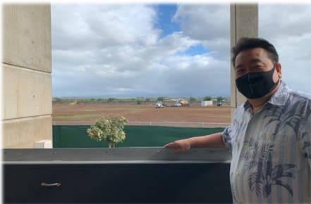
New School: Honouliuli Middle School.

Various Capital Improvement Projects Site Visits in 2020.