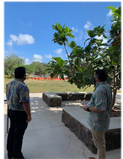
Kapiolani Community College.