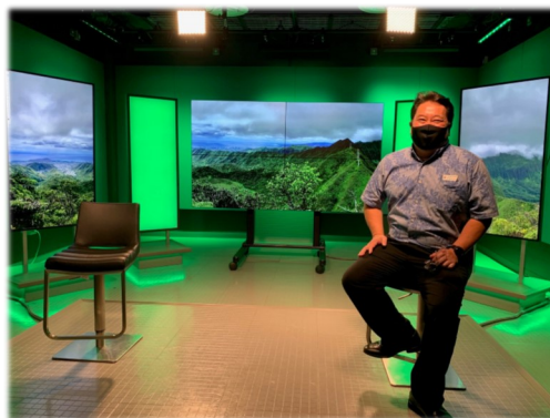
University of Hawaii.