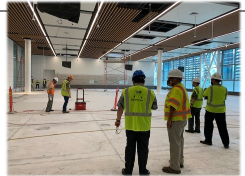
New Wing of Daniel K. Inouye Airport.