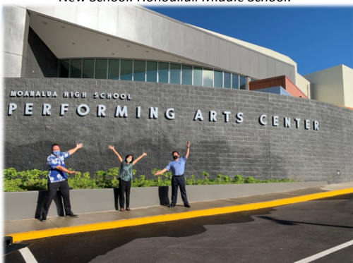
Moanalua High School: Performing Arts Center.

Various Capital Improvement Projects Site Visits in 2020.