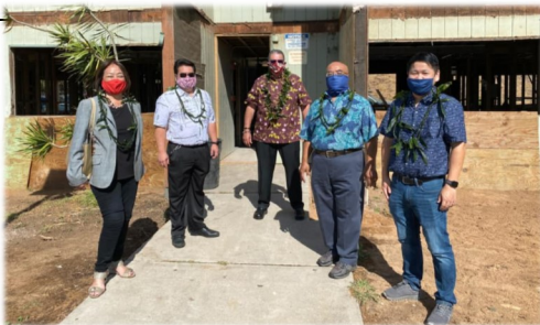
Maui County's Huliiau Apartments designed for homeless families.