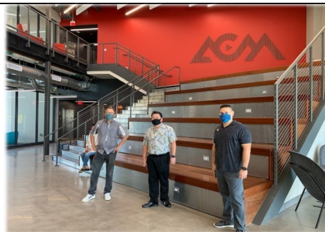
UHWO AMC Academy of Creative Media.