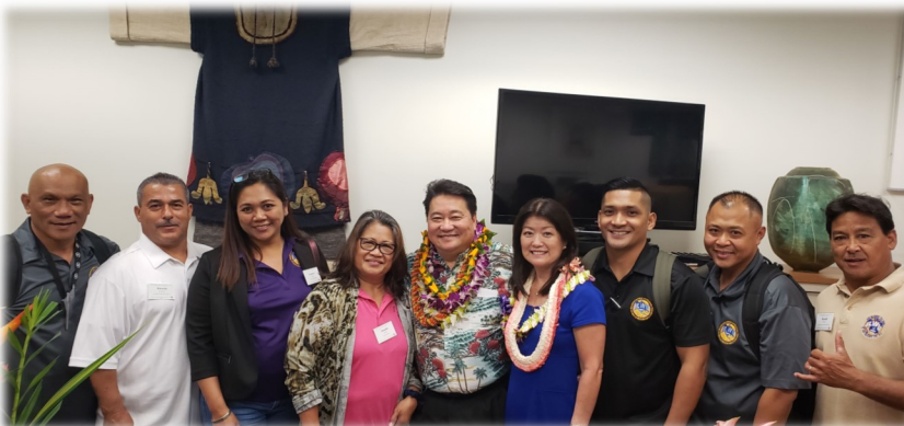
Opening Day with members of ILWU Local 142.