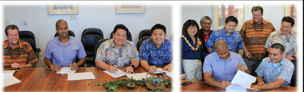
Representatives at the signing of the 2020 House Majority Package.