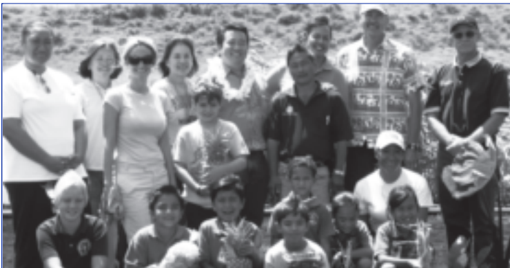
Celebrated Ag in the Classroom at the Ag Park.

Helping agribusiness. I introduced a bill to help farmers and agricultural businesses located in the state enterprise zones. To encourage the growth of Hawaii's agriculture industry, we amended the State Enterprise Zones (EZ) Law to recognize the unique challenges faced by this industry and allow more