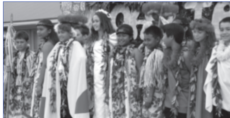
The May Day Court at Makawao Elementary School.