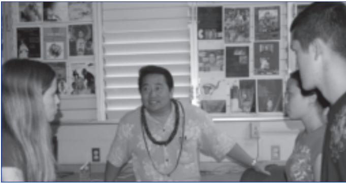
Visiting with Project East students at King Kekaulike High School.