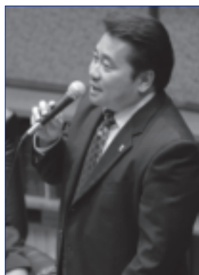
Speaking on the floor during legislative session.