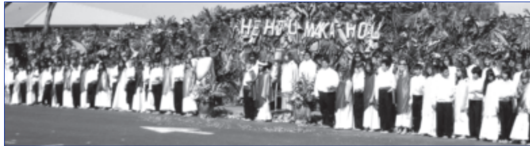
Kula Elementary School's May Day program shows the entire fifth grade class participating in the court.

These devices are often loaded with mercury and other potentially harmful substances and impact our limited landfill space.