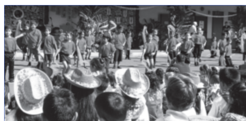
Watched the talented students at Pukalani Elementary School perform during the May Day program