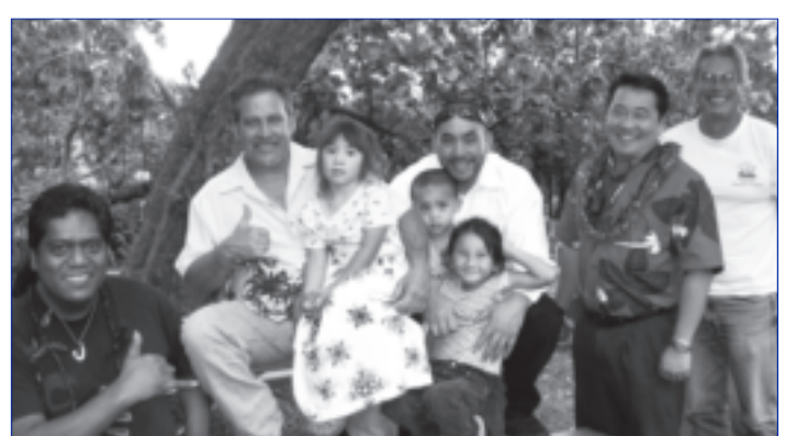
At Kula Hospital with employees and families during their May Day celebration.