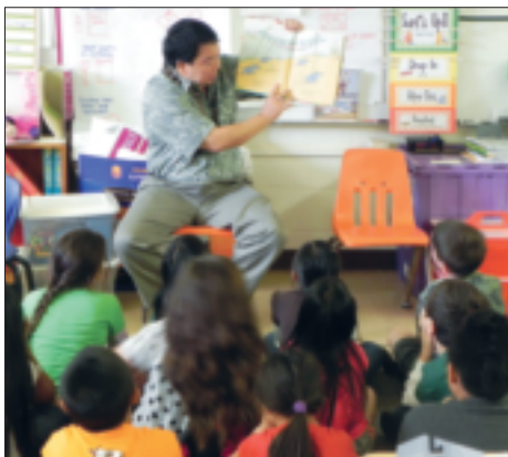
Celebrating Dr. Seuss' birthday by reading to Mililani Uka students.