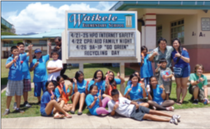
Going green with Waikele Elementary students at their recycling day.

Provides relief and support to organ donors by providing temporary disability benefits to employees who suffer disabilities as a result of donating organs.