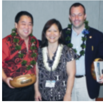
Receiving the 2014 Advocacy Award from Hawaii Academy of Family Physicians.

cents per hour beginning on January 1, 2015, and 75 cents per hour beginning on January 1, 2016.