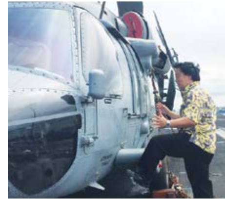
Supporting our troops

Improves the care of elderly persons by authorizing the Executive Office on Aging to establish the Kupuna Caregivers Program to assist community members in obtaining care for elders while