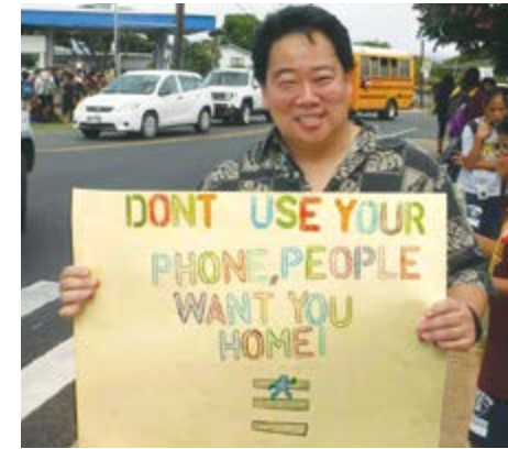
Raising awareness on pedestrian safety at Waipahu Intermediate School.

Provides additional protections for renters by establishing a cap of 8% on late rent payment fees where the rental agreement provides for a late charge.