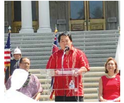
Celebrating 100 years American Red Cross, Hawaii's Centennial Anniversary at Iolani Palace.

veterans of World War II and to select the location of the monument.