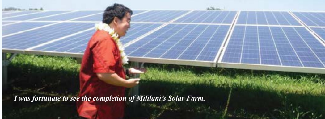
I was fortunate to see the completion of Mililani's Solar Farm.