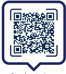
Scan for a testimony submitting how-to guide