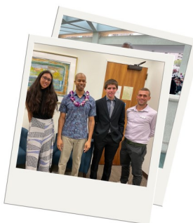
Right: The Boys & Girls Clubs of Maui visiting the Hawai'i State Capitol this session.