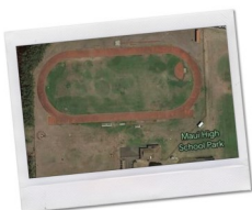
Above: Maui High School's current track and field.