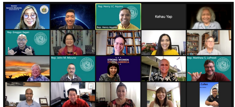
Above: Rep. Woodson and other members of the Filipino Caucus in a March meeting with Senator Mazie Hirono regarding US congressional initiatives.

This bill will bring much needed unemployment insurance relief to employers and small businesses across the state by reducing employer contribution rates. Without these protections, struggling businesses would face the highest rate, Schedule H, at a time when they can least afford it. By lowering the rate to Schedule D, the Legislature intends to help our local economy stay afloat without layoffs or other cost-cutting measures that would negatively affect workers.