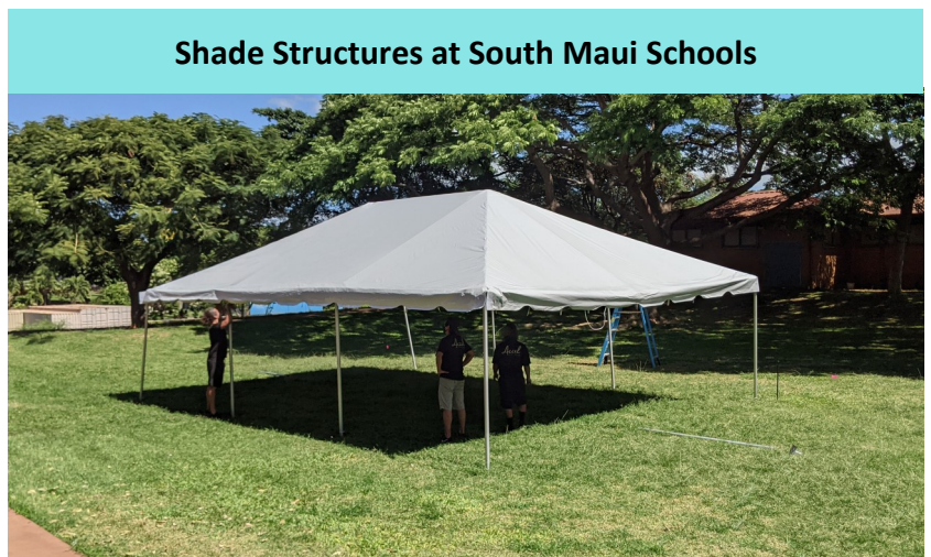
Shade Structures at South Maui Schools

Open this newsletter for updates on vaccine distribution, South Maui disaster preparedness, and my 2021 Resolution package!