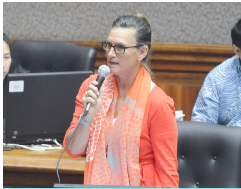
Speaking out on the House Floor