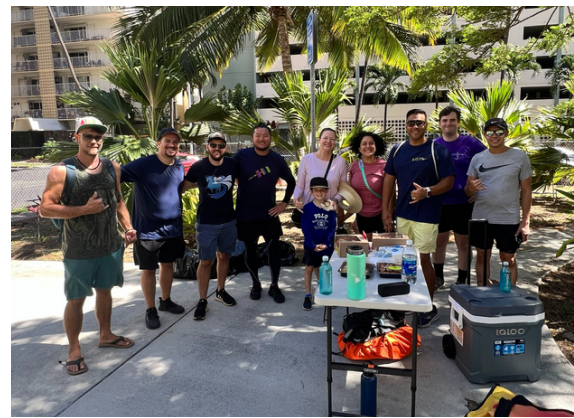
Community members at Centennial Park for a District Community Clean up. Mahalo to all who volunteered!