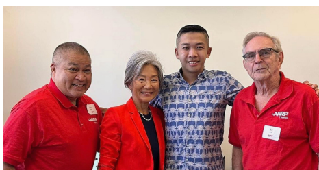
Meeting with members of AARP to discuss issues relating to our Kupuna.