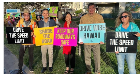
Advocating for safe driving with Waikiki citizens and stakeholders.