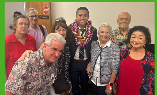
Opening Day with friends from the Waikiki Community Center