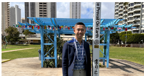
Unveiling of the Peace Pole at Jefferson Elementary School.