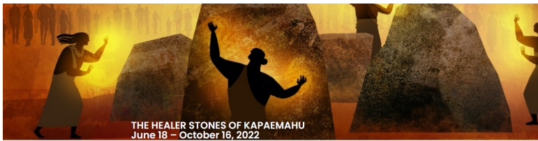
THE HEALER STONES OF KAPAEMAHU June 18 – October 16, 2022