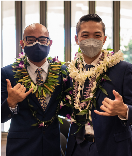
Rep. Tam with Rep. Greggor Ilagan on Opening Day