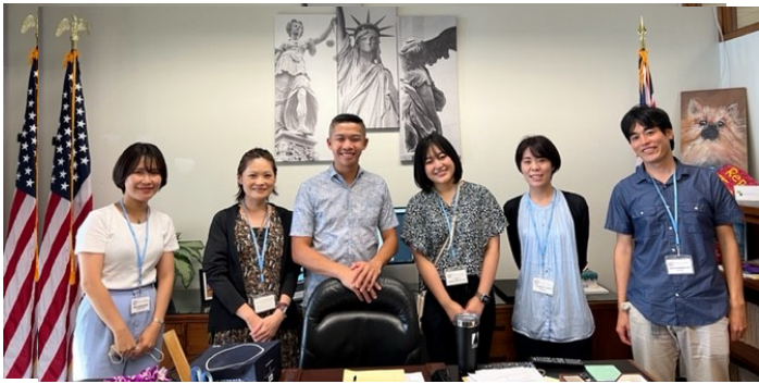
Happy to host a group of visiting social workers from Japan participating in a training session at HPU.