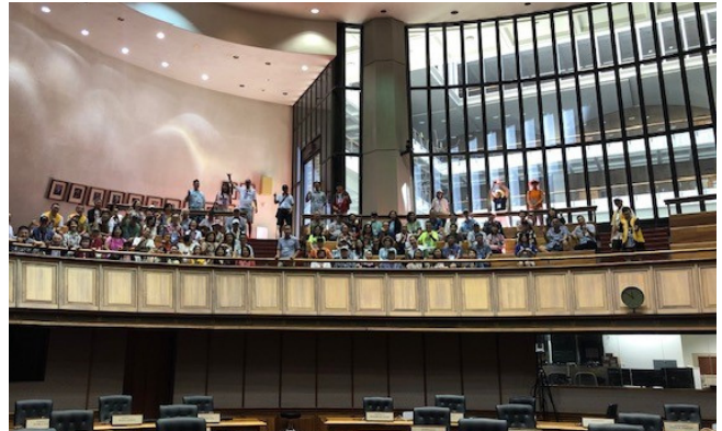
Over 200 participants from the Taiwan Chambers of Commerce North America visited the Capitol.

Building hours: 7am. to 5pm, Monday – Friday