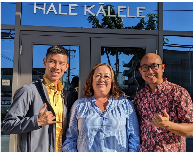
Rep. Sayama touring Hale Kālele's affordable housing units with Vice-Speaker Greggor Ilagan.

Located along the Wai'alae corridor next to the Kaimukī small business district, the property is within a two-mile radius of three public elementary schools, two public middle schools, and two public high schools. Its location and current use as a DOE office space makes this property an ideal candidate for a mixed use housing project like Hale Kālele: a mixed-use affordable housing development opened along Pi'ikoi last year.