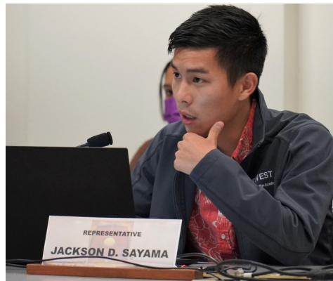
Rep. Sayama questioning testifiers at a committee hearing.