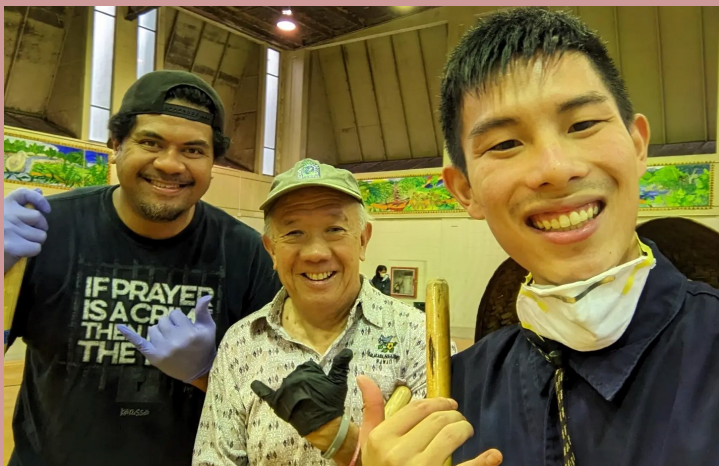
Rep. Sayama pictured with City Councilmember Calvin Say at a recent clean up of Pālolo Valley District Park.