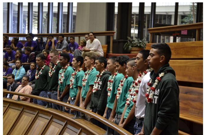
PAHOA HIGH SCHOOL DAGGERS , 2015 BIIF Division II champions visiting the State Capitol while they were on Oahu for the state championship.

...e that is money spent in the community