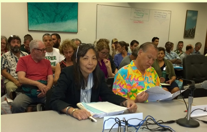
Conference Member: At conference committee for HB321, Medical Marijuana Dispensaries. (I was 1 of 5 house committee members)

HB321 HD1 SD2 CD1 - Medical Marijuana Dispensaries; For the first time since medical marijuana was legalized 15 years ago, a licensing system for medical marijuana dispensaries is created. A certifying physician need not be the qualifying patient's primary care physician but it still requires a bona fide physician-patient relationship with the qualifying patient. This bill still allows a patient to grow their own medical marijuana. However, this bill allows persons authorized to use and possess medical marijuana in other states to be treated similarly to qualifying patients in this State pursuant to rules adopted by the department of health after 1/1/2018. This bill further authorizes the department of health to conduct criminal history checks on license applicants, licensees, prospective employees of dispensaries and production centers, subcontractors, and persons authorized to enter and remain on such premises.