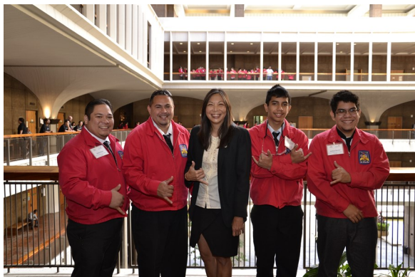
Vocational Industrial Club of Hawaii Students from the Vocational Industrial Club of Hawaii at Pahoa High School were on Oahu for the auto service competition with SKILLS USA.