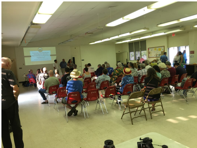
DoH and Civil Defense were present to give an overview on the status of Dengue Fever