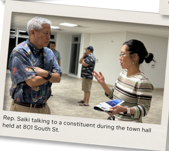
Rep. Saiki talking to a constituent during the town hall held at 801 South St.