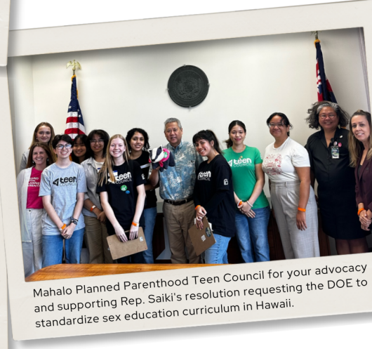
Mahalo Planned Parenthood Teen Council for your advocacy and supporting Rep. Saiki's resolution requesting the DOE to standardize sex education curriculum in Hawaii.