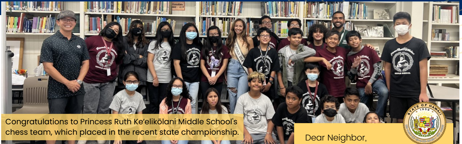
Congratulations to Princess Ruth Ke'elikōlani Middle School's chess team, which placed in the recent state championship.