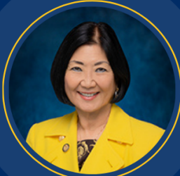
SENATOR SHARON Y. MORIWAKI