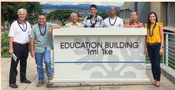
Left - Members of the House Committee on Lower and Higher Education visited Kapi'olani Community College and Leeward Community College on September 26, 2019 to learn about campus programs and needs.