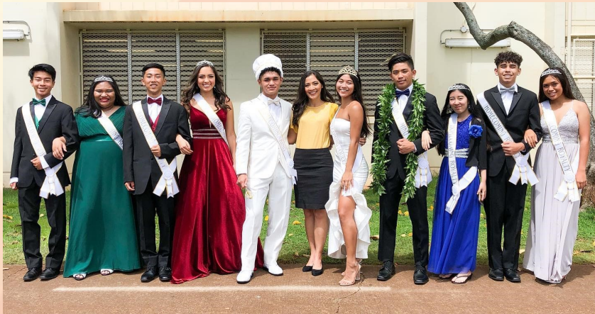
Top Left - Congratulations to Mililani High School's 2019 Homecoming Court. On October 4, 2019, Rep. Okimoto participated in Mililani High School's homecoming parade.