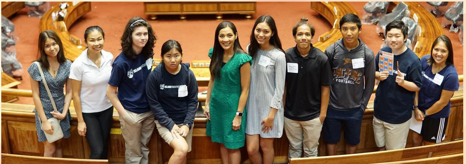
Top - Students from Island Pacific Academy, Waipahu High School, and University Lab School participated in the Pacific Century Fellows Career Crawl on October 8, 2019, and visited the State Capitol to learn about the legislative process.