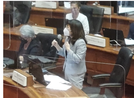
Speaking during Floor Session to support affordable housing bills.