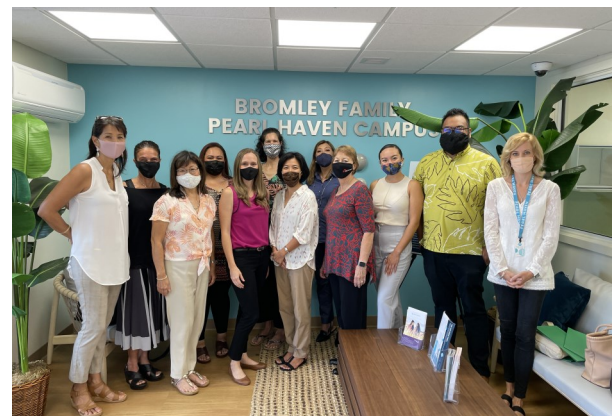
Visiting the Pearl Haven, a new special residential treatment facility for sexually exploited & trafficked youth.