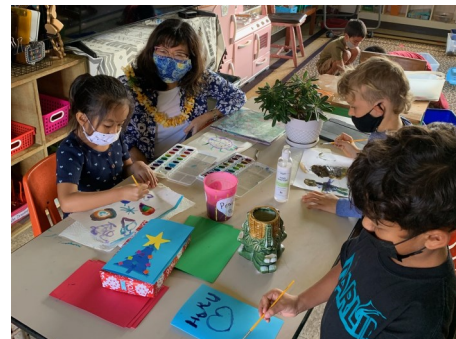
Visiting the students at Kilauea Elementary School.

Appropriates funds to the School Facilities Authority for the construction of preschool facilities for children who are three and four years old.