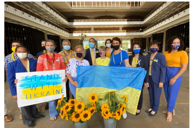
Standing with Hawaii residents from Ukraine, following the passage of a house resolution condemning Russia's unprovoked attack on Ukraine.