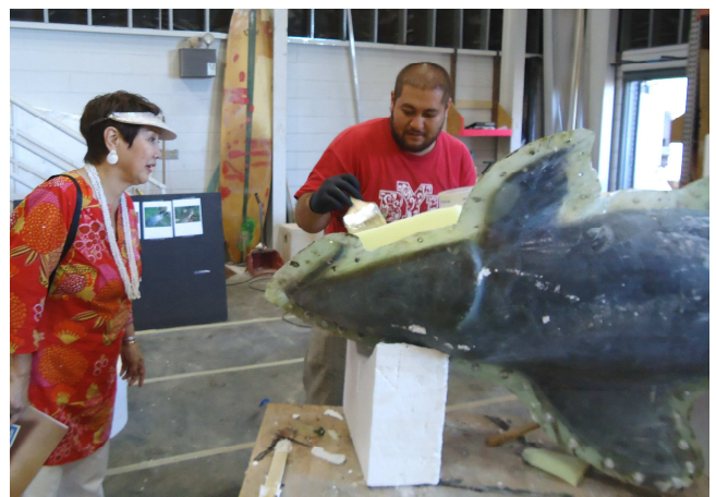
Prop making for The River in the 18th Ave. Hawaii Film Studio.