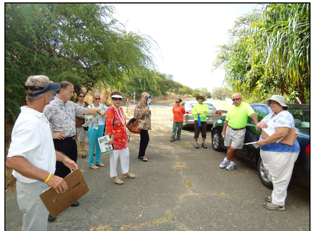
DLNR officials outline Diamond Head improvements.

Flashlights were required to see the basement of the empty Kamamalu Building and then climb to the 9 th Floor. Should the State leave the building vacant, remodel it in order to sell, lease or move departmental personnel into it that are now paying for leased private space? The Committee also visited the old Waimano Home “campus” that occupies 280 acres above Pearl City. The Department of Health occupies a few buildings, but many are empty and decaying. Marumoto favors selling a portion for residential use. The Committee also viewed improvements at Honolulu Airport, visited Central and North Shore Oahu that included Lake Wilson (another expensive problem) and a wind farm. The Committee found that in the last few years the Hawaii Youth Correctional Facility has shown great improvement. At one point the federal government was threatening to take over the facility under a consent order. The House Republican Caucus took a field trip to Maui to observe Kihei Charter School, the Maui Economic Development Board to learn about the Haleakala Observatory activities (Air Force Research Laboratory and the UH Institute for Astronomy), and visit the Maui High Performance Computing Center, the Joint Information Technology Center and Pacific Defense Solutions, LLC.