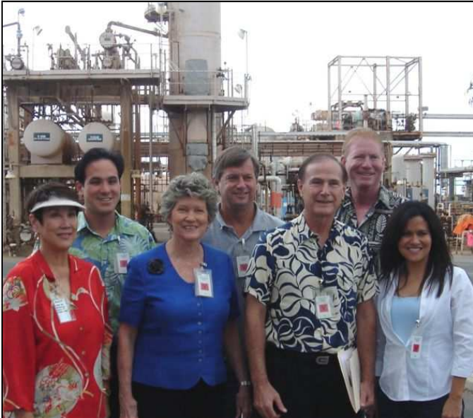
Legislators tour the Chevron Refinery at Barbers Point