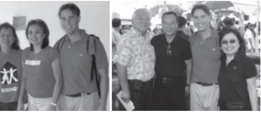
Senator Clearence Nishihara, Louie and Belen Butay and, Joey