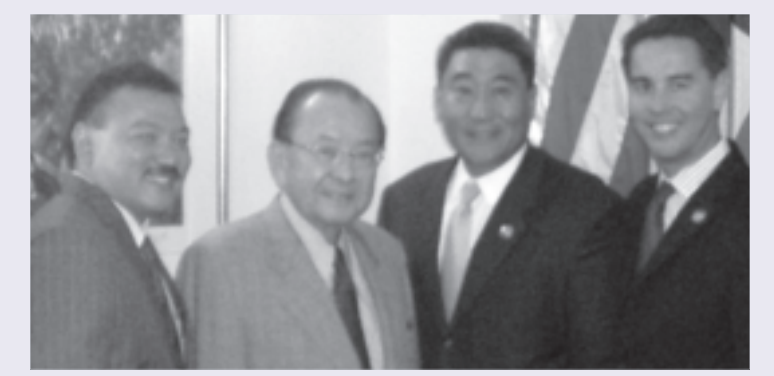
U.S. Senator Dan Inouve