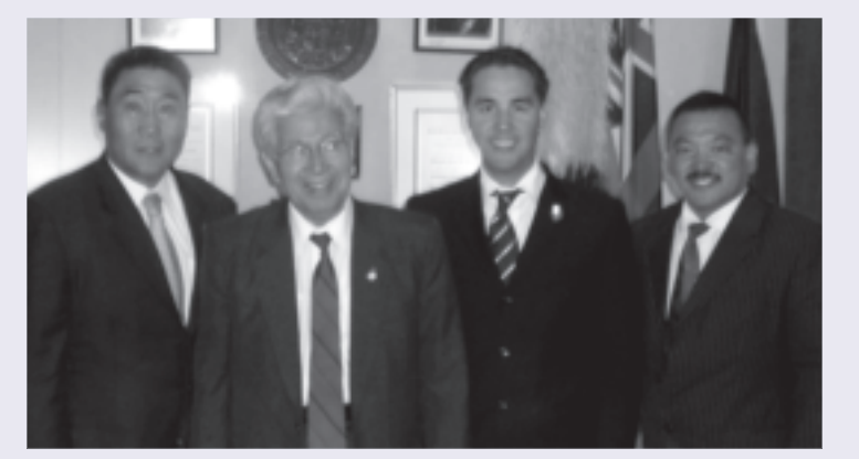
U.S. Senator Dan Akaka